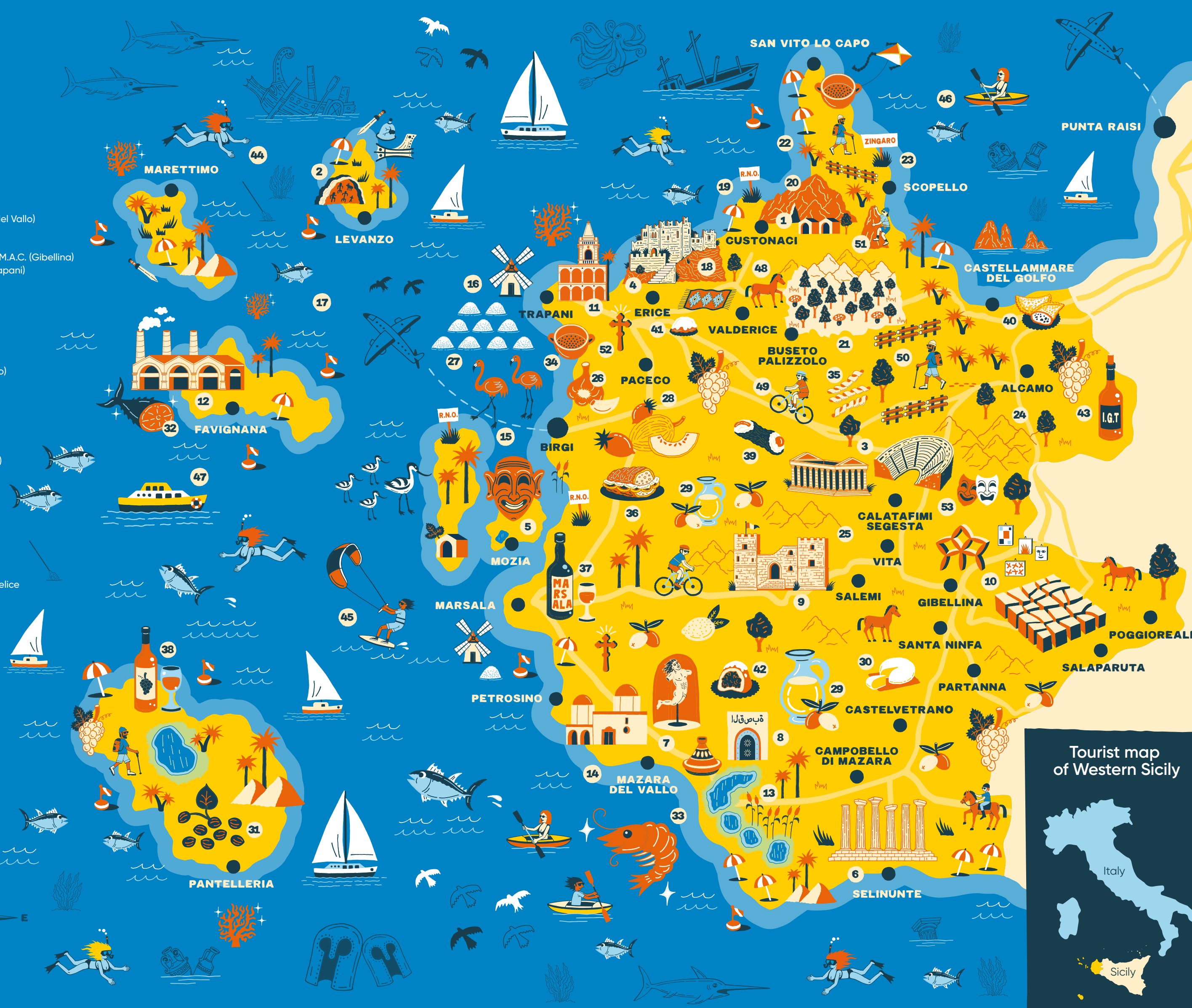
Tourist map of Western Sicily